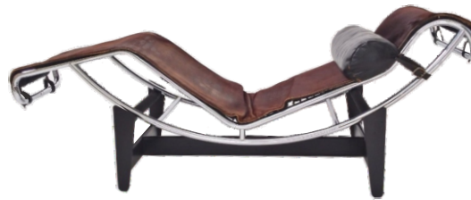
LC4 CHAISE LONGUE (LOUNGE) CHAIR MODEL B306 - 1928

FOR MORE DETAIL ON CHARLOTTE PERRIAND AND OTHER DESIGNERS GO TO THE 'DESIGNERS' SECTION OF www.technologystudent.com